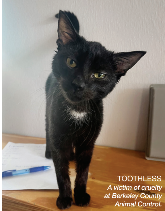
TOOTHLESS A victim of cruelty at Berkeley County Animal Control.