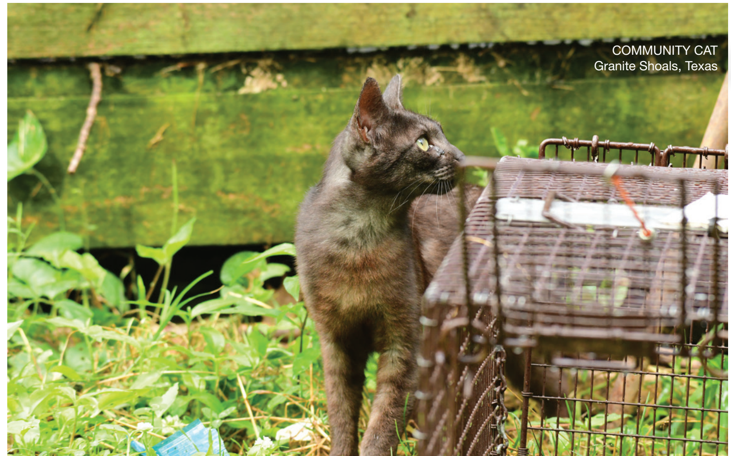
COMMUNITY CAT Granite Shoals, Texas

Meet Sunny, cat #1,000 neutered by our previous grant in Atlantic County, New Jersey! He is just one of thousands of cats who've received care since we began a new phase of spay and neuter and TNR work in the area in 2022 (plus tens of thousands of pounds of cat food given through our community cat food bank support).